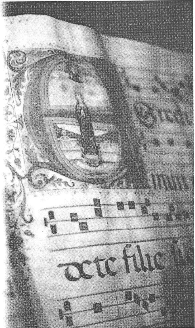
Medieval illuminated manuscript from Florence, Italy.

Recently, St. John’s Abbey and University in Collegeville commissioned a new illuminated Bible for the twenty-first century.